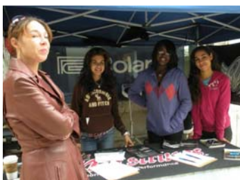
A&M students manning the John Lennon booth On the Plaza

The John Lennon Educational Bus Tour was a huge success on the plaza with all of A&M’s talented music students getting a chance to view the high tech equipment, meet with the “stars,” get tips on honing in on their performances and do some quality recording themselves.