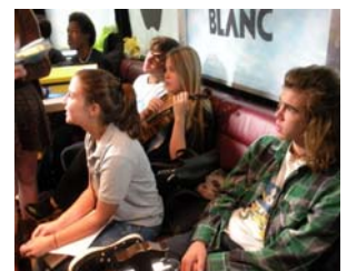
Listening to the recordings in The Bus