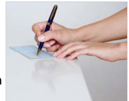
When the McKay payment arrives, the parent or guardian of record must endorse the warrant over to the school.

The Department is also required to review a sample of endorsed scholarship warrants after each payment period to confirm compliance with the restrictive endorsement requirements.