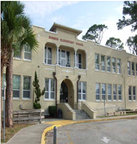
New Home of Chiles Academy

The Chiles Academy serves pregnant or parenting teens in East Volusia County from grades 6-12. Children aged from two weeks to three years old may attend too. In addition, the academy offers a specialized computer-based curriculum, self contained classes, parenting classes and on-site child care. Volusia County buses provide transportation to and from the site.