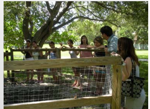
Summer camp participants