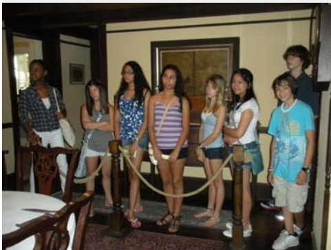
Summer camp participants

Summer Camp On the Plaza 101 introducing incoming A&M students to Coconut Grove's rich pioneer history -- all within walking distance of the A&M campus.