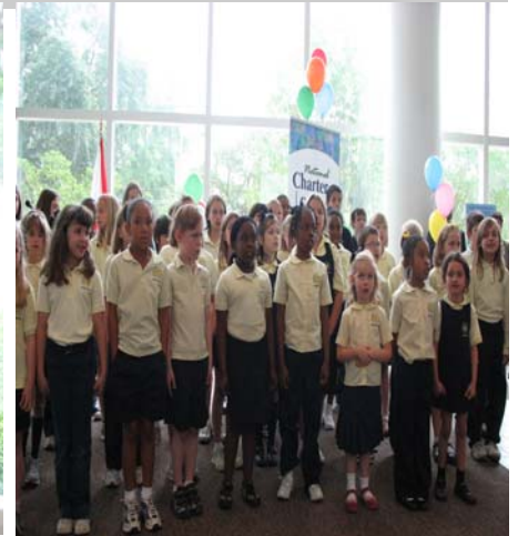
Students from Imagine School at Evening Rose