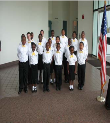
Students from CARE Charter School of Excellence